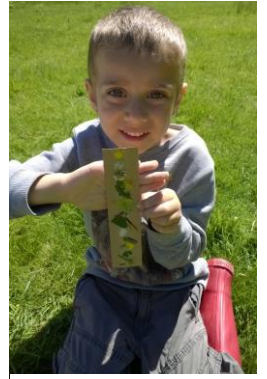
A plant bookmark.

The next Be Wild Club is on Saturday 11 th November (no club in October as it is Suntrap's 50 th anniversary open day) and there are places available. Please contact Suntrap to book your place for some forest fun.