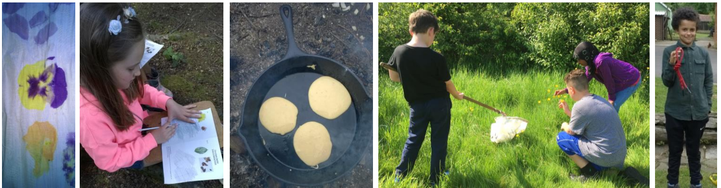
From left to right. Plant prints on a bandana. Leaf rubbings in the forest. Delicious pancakes cooked on the fire. Catching insects in a forest meadow. Learning the art of knot tying in true Ray Mears' style.